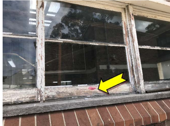
Photo 8. Exterior, throughout, window frames – lead-containing white upper paint system.