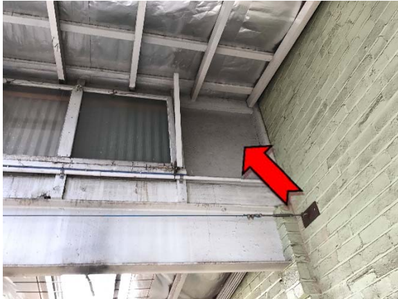
Photo 1. Interior, ground level, throughout, workshop, high level infill panels – asbestos-containing fibre cement sheeting.