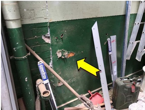
Photo 9. Interior, carpenter's workshop, western wall –lead-containing green upper paint system.