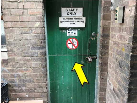
Photo 7. Exterior, office, door and door frame – suspected lead-containing green upper paint system.