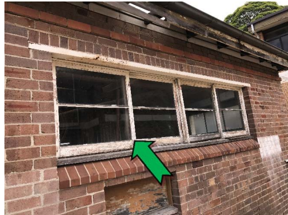
Photo 4. Exterior, ground level, throughout, window frames – non asbestos-containing window caulking.