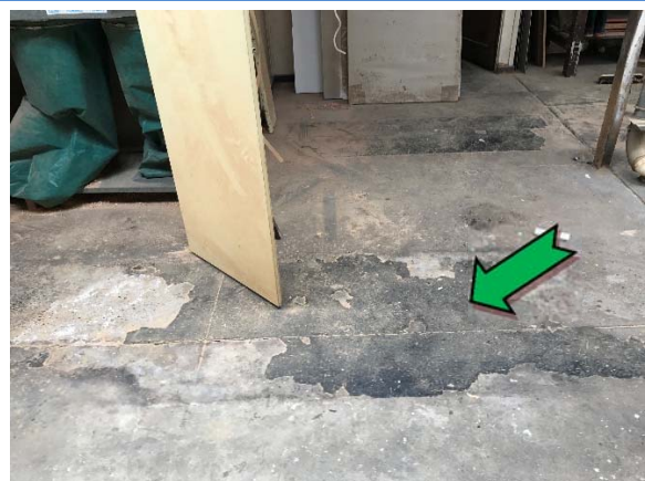
Photo 6. Interior, carpenter's workshop, black floor covering – non asbestos-containing bituminous material.