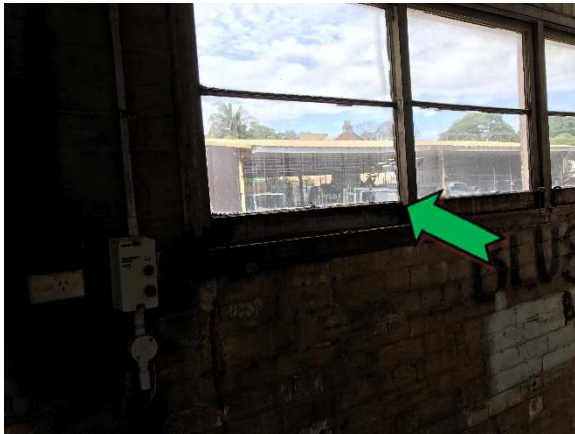
Photo 3. Interior, ground level, throughout workshop, window frames – non asbestos-containing bituminous material.