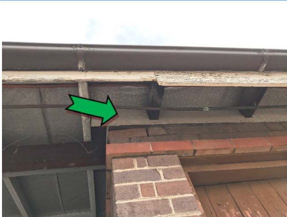
Photo 5. Exterior, throughout, infill panels below roof – non asbestos-containing fibre cement sheeting.