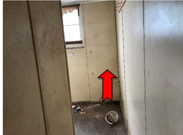
Photo 2. Interior, ground level, store 2, wall – asbestos-containing fibre cement sheeting.